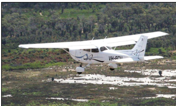
VH-ECU, the school's Cessna C172 G1000

One of the highlights of the Kent Street Aviation Course is the opportunity for students to experience the exhilaration of flight in the form of an Air Experience Flight (AEF). An AEF is one of a series of flights that allows the student to become increasingly familiar with the sensation of flying as well as the controls, instrumentation and operation of aircraft.